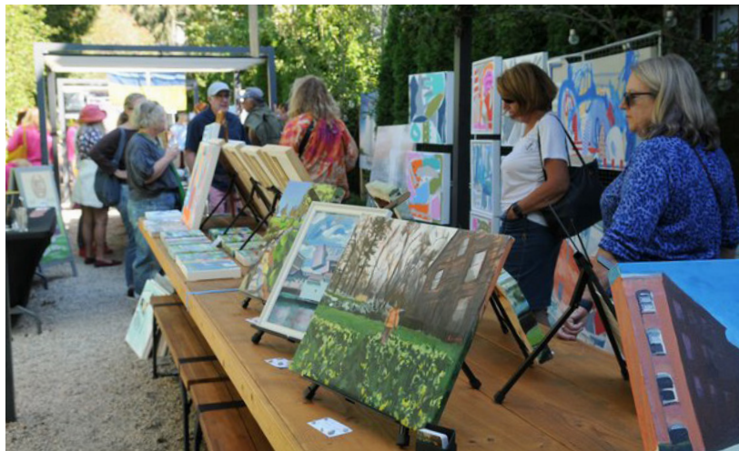
TABLED ARTIST SETUP