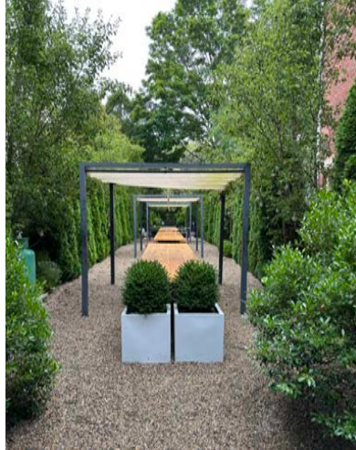
THE COVE LEDGE BACK GARDEN