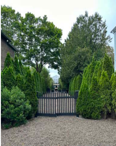
BACK GARDEN ENTRANCE ON MAIN STREET